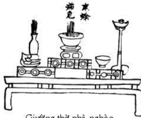
Giường thờ nhà nghèo